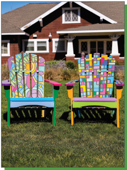
CHAIRS #10 & #11