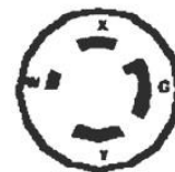
4. 30 Amp 4 Pole Twist-Lock

If your electrical plug/connector is not illustrated, please supply a picture along with your form – or contact us so that we can provide the proper amount of power to your booth.