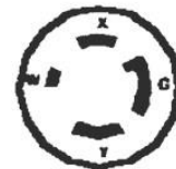
4. 30 Amp 4 Pole Twist-Lock

If your electrical plug/connector is not illustrated, please supply a picture along with your form – or contact us so that we can provide the proper amount of power to your booth.