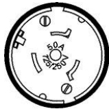
2. 50-Amp Twist-Lock