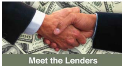
Meet the Lenders

At the conclusion of the panel discussion, the panelists will meet one-on-one with attendees to answer questions. For registration or more information, visit our website .